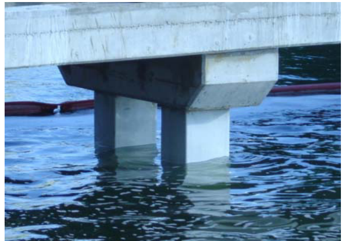
Galvanode Jacket provides protection to piles

*As with all galvanic protection systems, service life is dependent upon a number of factors including reinforcing steel density, concrete conductivity, chloride concentration, humidity and anode mass.